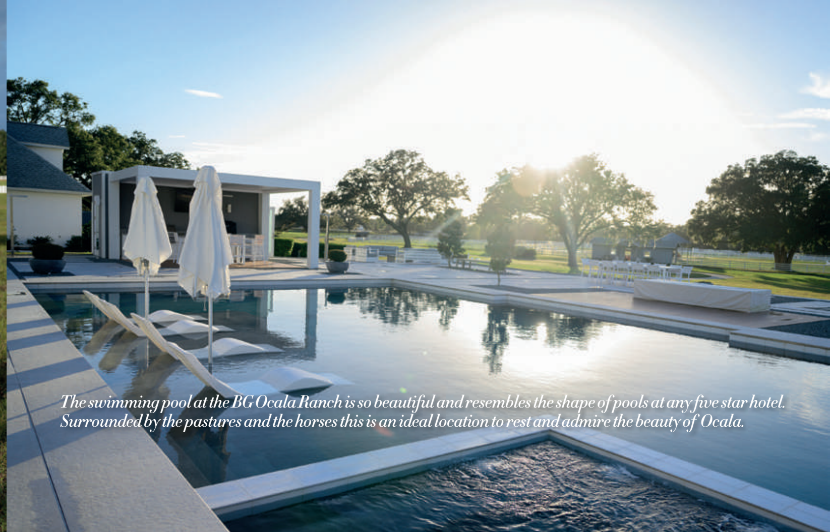
The swimming pool at the BG Ocala Ranch is so beautiful and resembles the shape of pools at any five star hotel. Surrounded by the pastures and the horses this is an ideal location to rest and admire the beauty of Ocala.